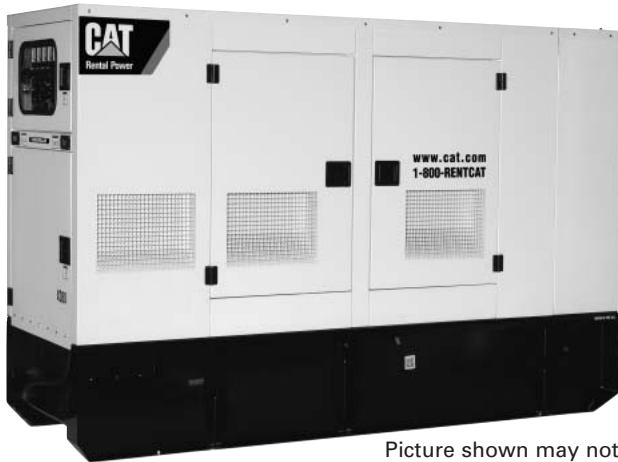
Picture shown may not reflect actual package.