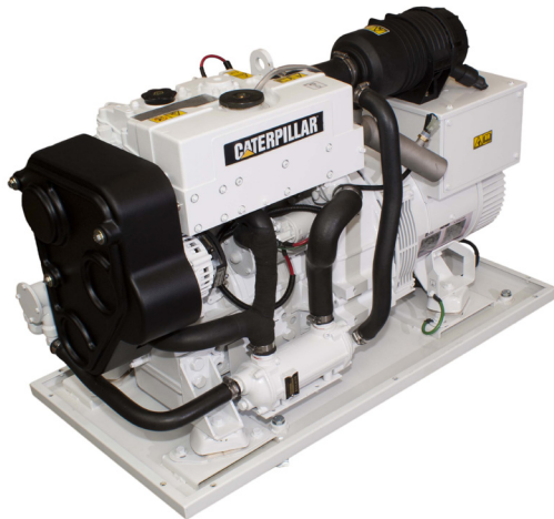
C1.5 Marine Generator Set Tier 3 Compliant