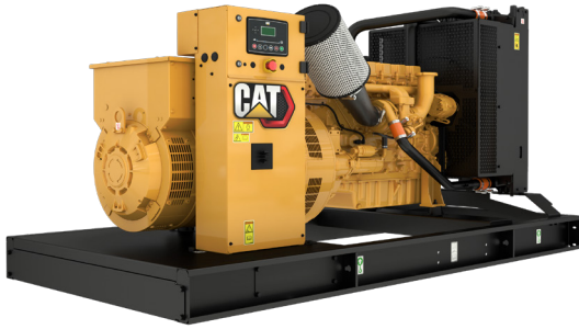
Image shown might not reflect actual configuration